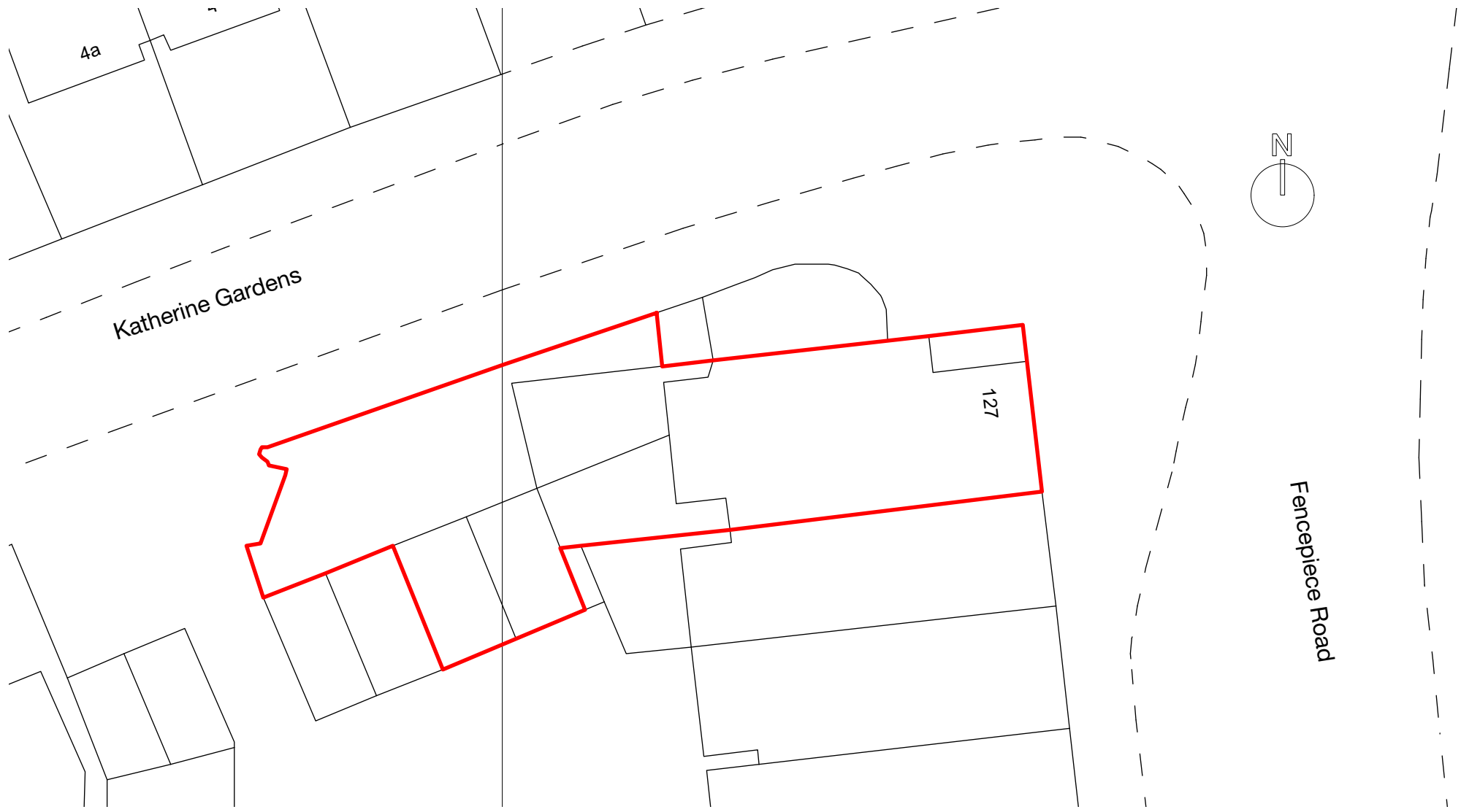
① Site Plan Scale: 1:250